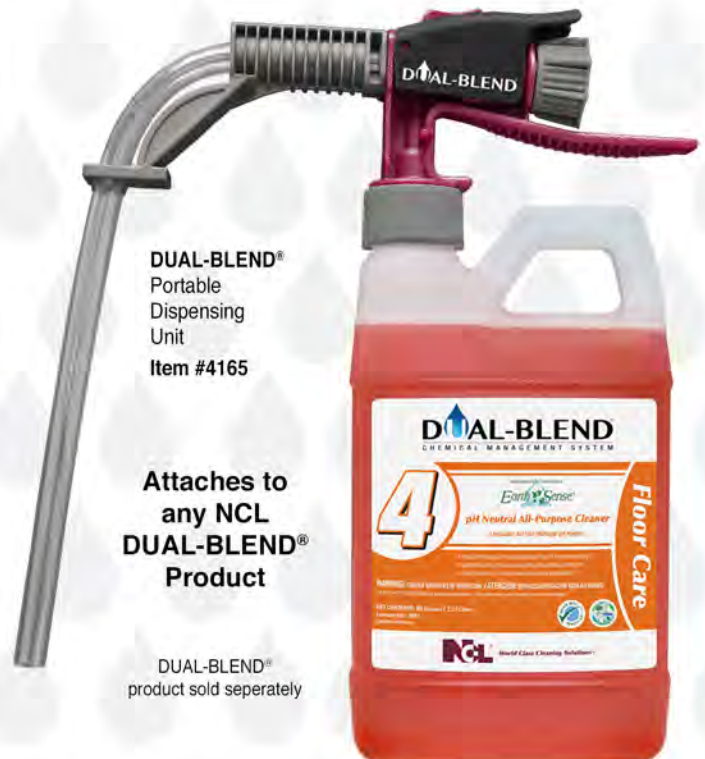
DUAL-BLEND® Portable Dispensing Unit Item #4165