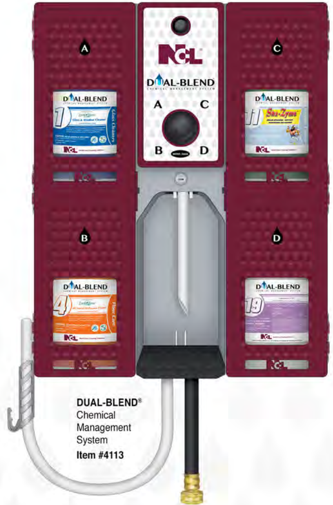
DUAL-BLEND® Chemical Management System Item #4113