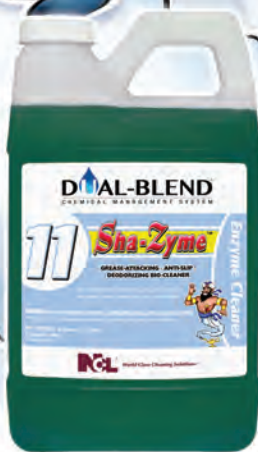
4081-24 4 x 80 oz case

Grease-Attacking / Anti-Slip Deodorizing Bio-Cleaner