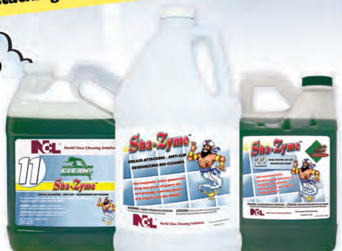
4081-35 4 x 1 gal case

401 N. 10 th Street • Philadelphia, PA 19123 (800) NAT-CHEM • (215) 922-1200 • Fax (215) 922-5517 • www.nclonline.com