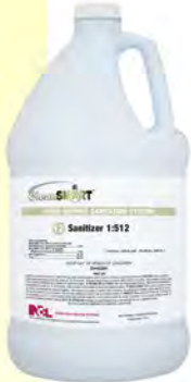
Product No. 1116