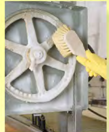
Product No. 1115