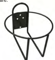
Product No. 4145