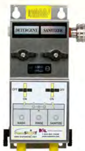
Product No. 4118