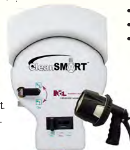
Product No. 4119