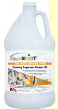
Product No. 1117